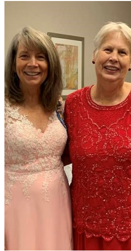
Heralds in Illinois