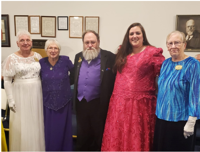
Heralds and Guardians in Iowa