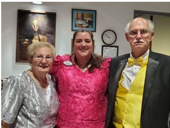
Heralds and Guardians in Alaska