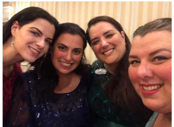
It was great to be with my sisters at my reception!