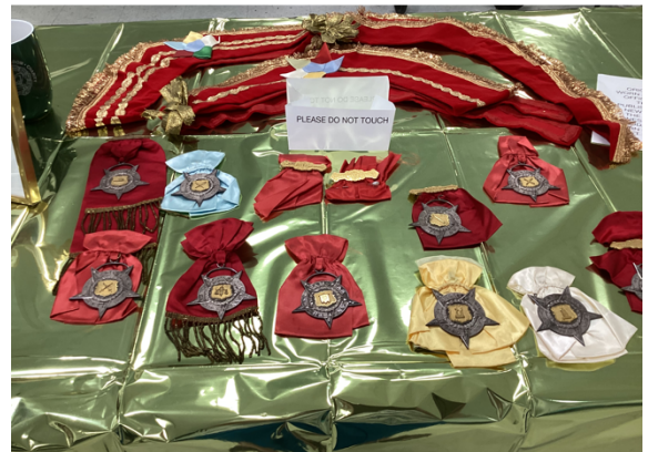
Original Rite of Adoption Officer Jewels of Golden Crown Court and the red and gold sashes on which they were worn.