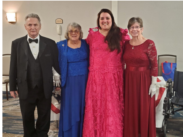
Heralds and Guardians in Louisiana.