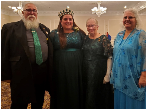
Heralds and Guardians in Wisconsin