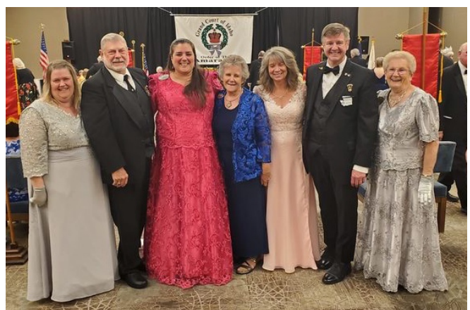
Heralds and Guardians in Idaho