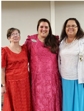
Heralds in Louisiana

I hope everyone has a wonderful holiday season and Happy New Year.