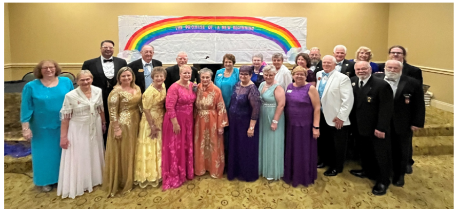
Past Grand Royal Matrons and Past Grand Royal Patrons of Pennsylvania