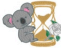
With Embroidered Logo