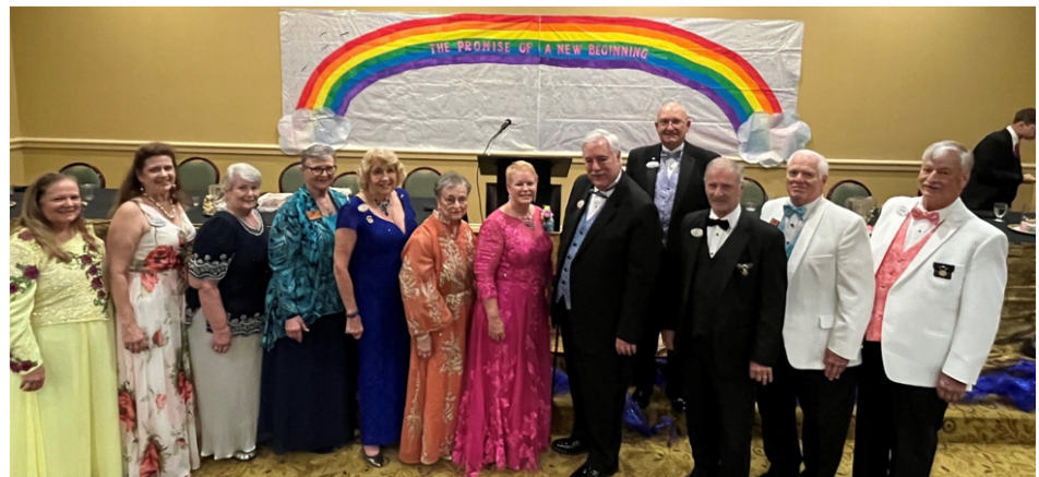
Past Supreme Royal Matrons and Past Supreme Royal Patrons