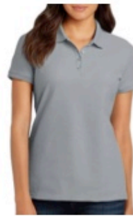
Ladies Polo Shirt