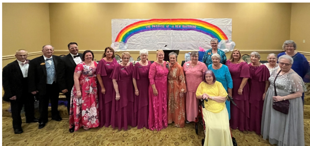
Members of Victory Court No. 149, located in Elizabethtown, PA