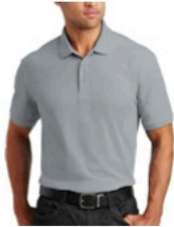
Mens Polo Shirt