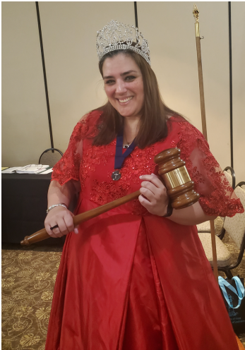
Returning the traveling gavel from Louisiana