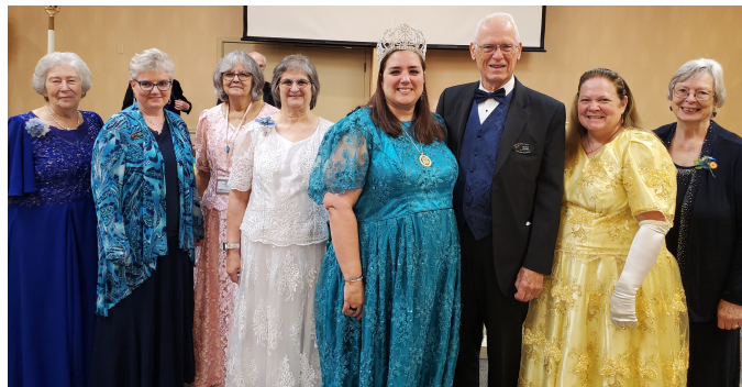
Supreme Officers in Alaska