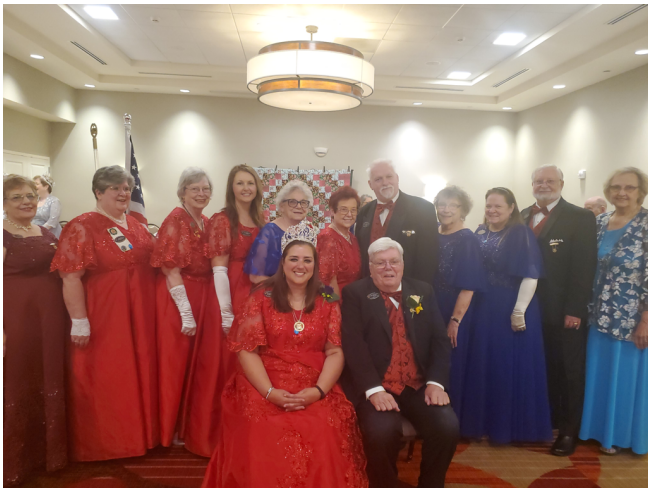
Supreme Officers in Iowa