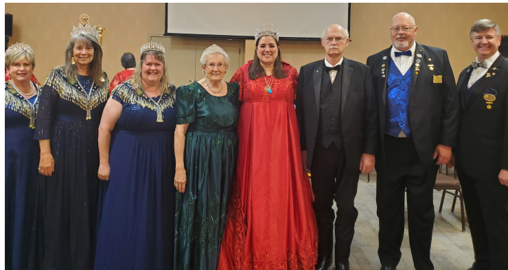
Heralds and Guardians in Alaska