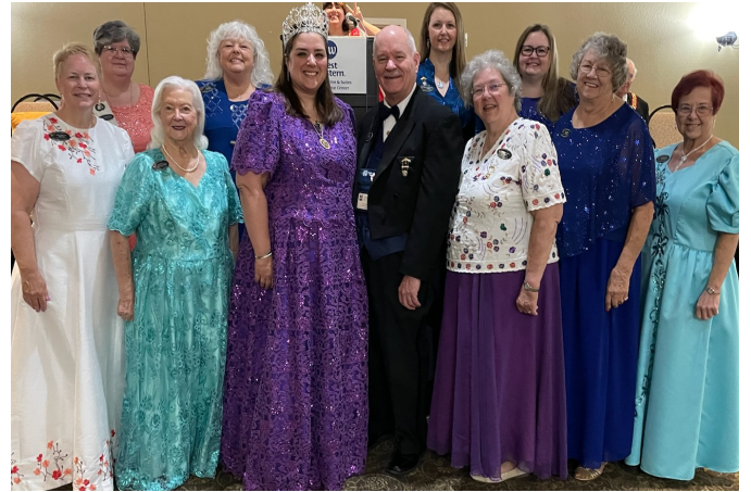
Supreme Officers in Louisiana