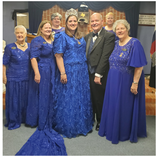
Supreme Officers in Baytown