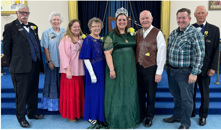
Supreme Officers in Silver State