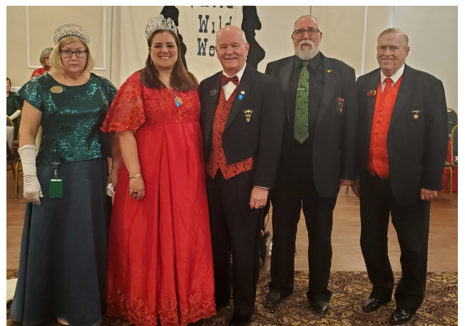
Heralds and Guardians in WI