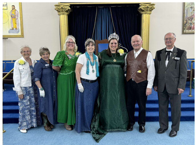
Heralds and Guardians in Silver State