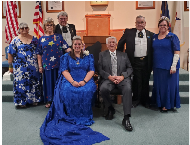
With the Royal Matrons and Patrons of Idaho SCJ