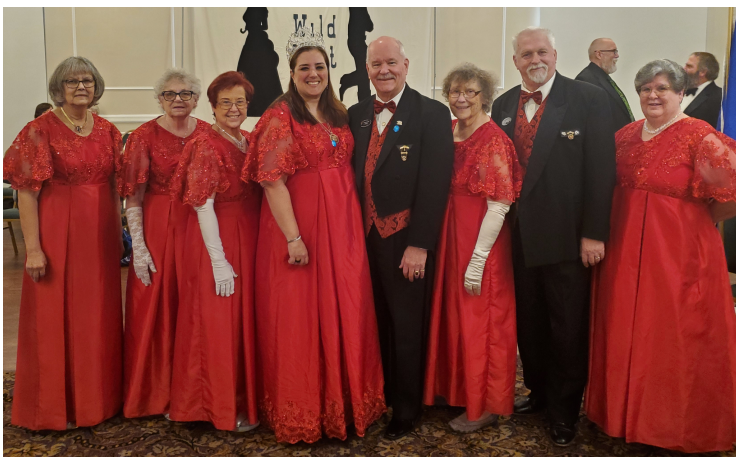
Supreme Officers in Wisconsin