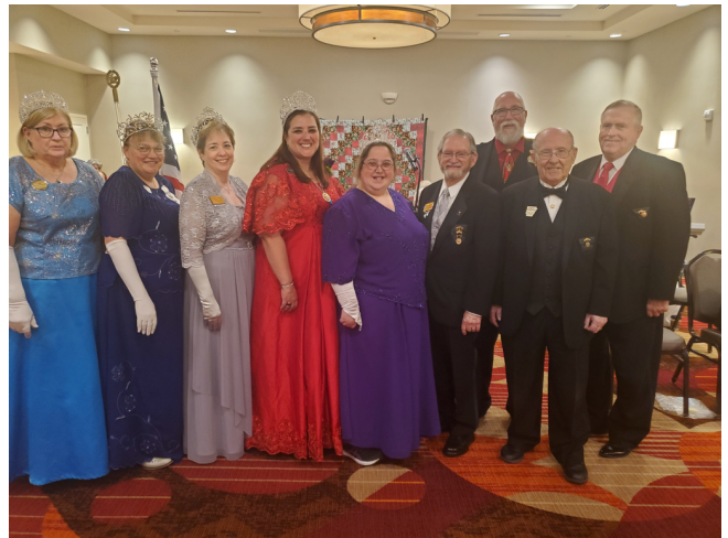
Heralds and Guardians in Iowa