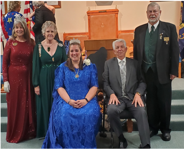
Heralds and Guardians in Idaho