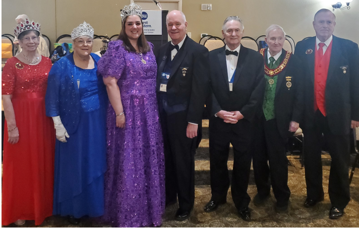
Heralds and Guardians in Louisiana