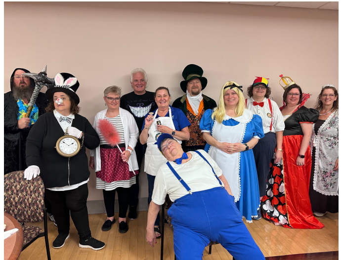
The cast of "Tweedledee's Murder in Wonderland"