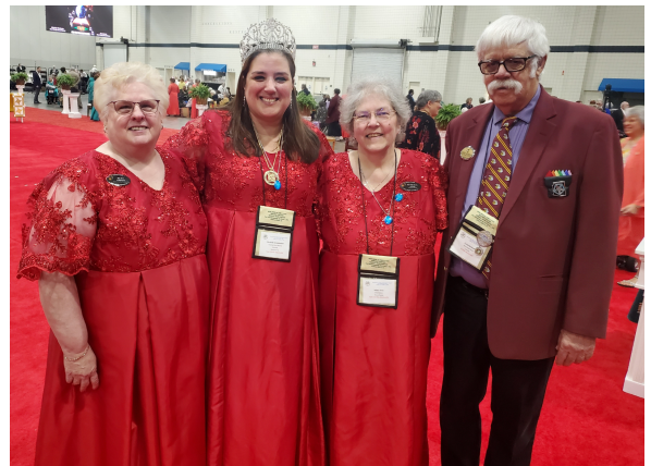
Supreme Floor Officers at General Grand Chapter OES (Missing Linda)