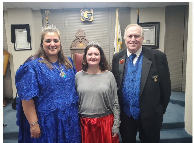
Heralds and Guardians in Bluebonnet