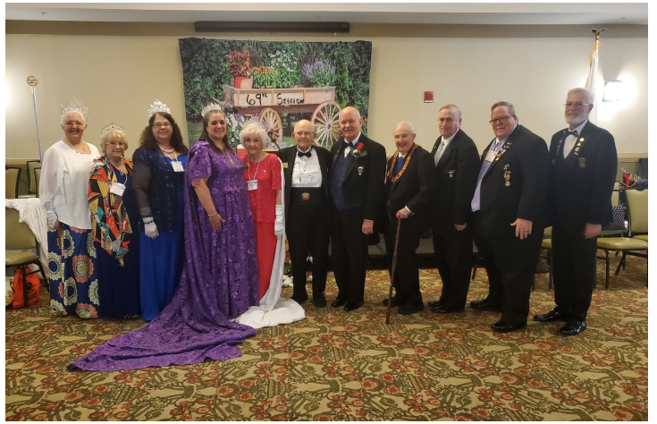
Heralds and Guardians in AL