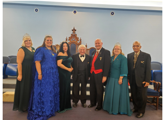
Heralds and Guardians in Heritage Court