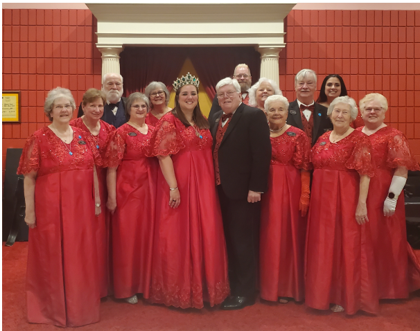
Supreme Floor Officers in NC