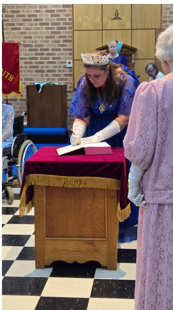
Signing the Bible at Central Lakes Court