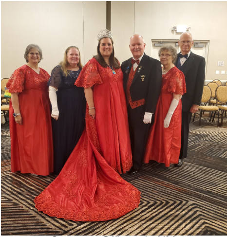
Supreme Officers in NM