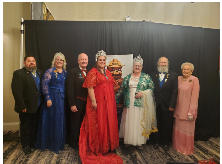
Heralds and Guardians in NM