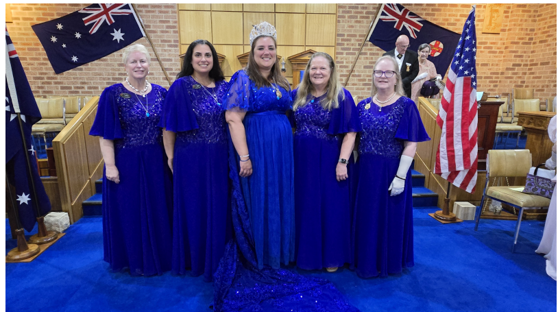
Supreme Floor Officers in Australia