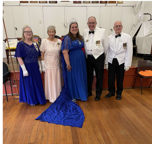
Heralds and Guardians in Queensland