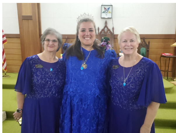
My Supreme Marshal and Page in Pineland