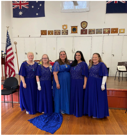
Supreme Officers in Australia.