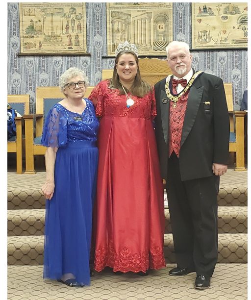
Supreme Officers at the IA Initiation