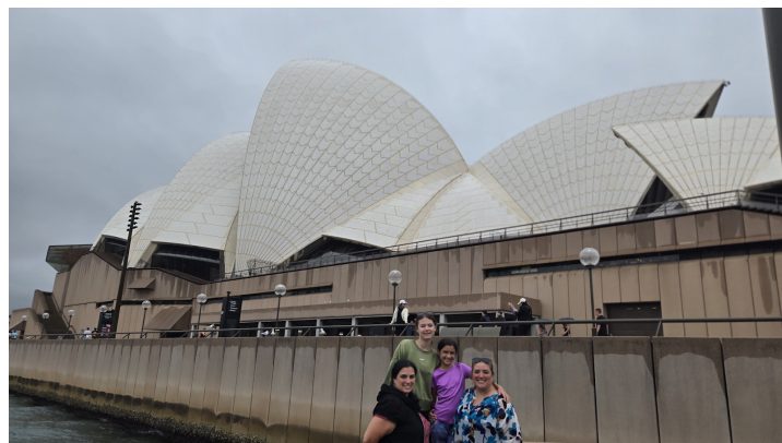
With the family in front of the Sydney Opera House