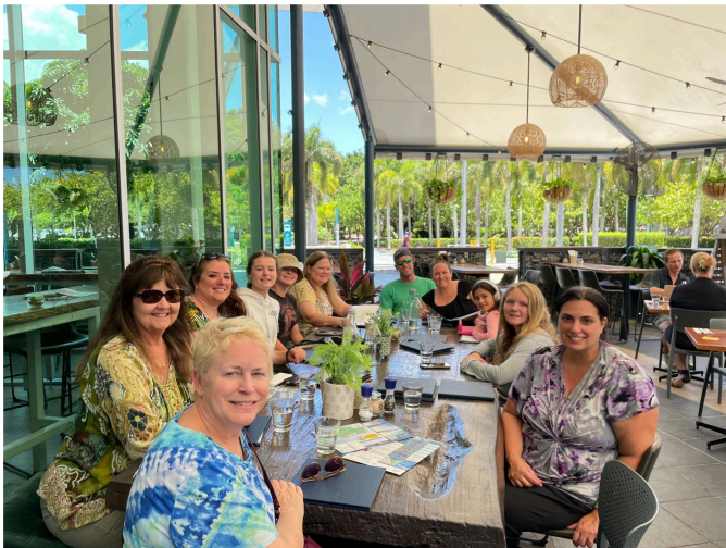
Wonderful delegation in Australia.