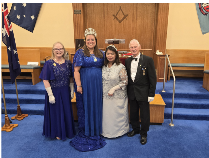
Heralds and Guardians at Royal Victoria