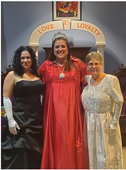
My Marshal and Page in Lily of the Valley