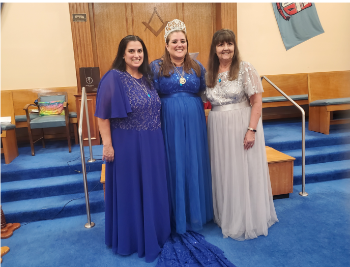
My Marshal and Page in the Australia Courts