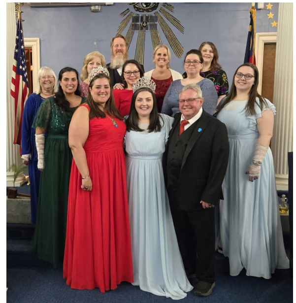
Visiting LaFayette Court NC