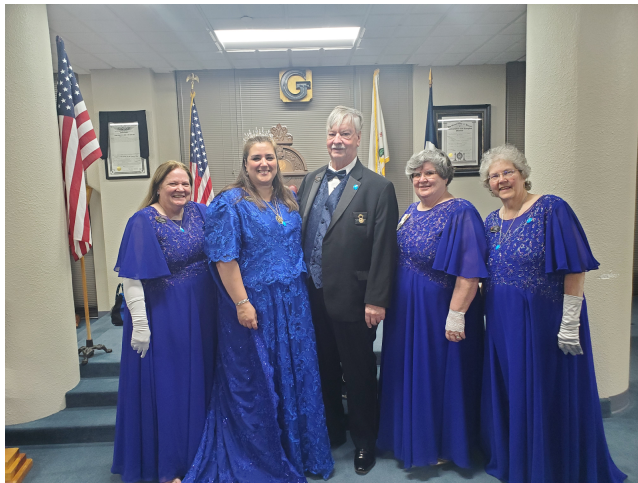
Supreme Officers in Bluebonnet Court