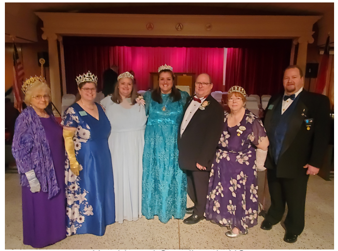
Heralds and Guardians in NC