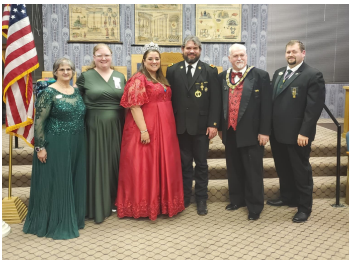
Visiting Members to Iowa Initiation