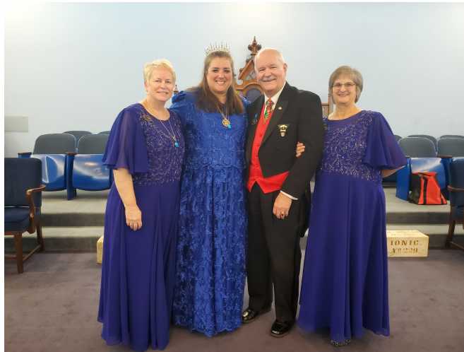
Supreme Officers in Heritage Court