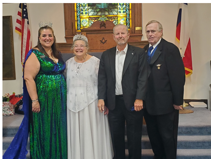
Heralds and Guardians in Yellow Rose