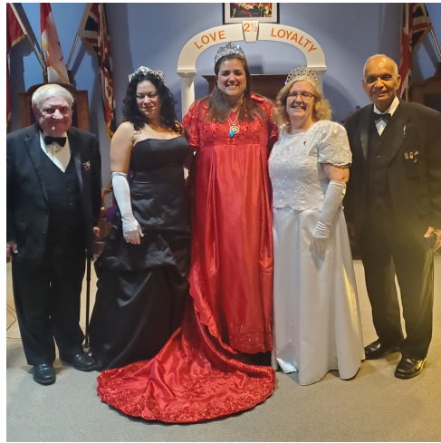
Heralds and Guardians in Lily of the Valley