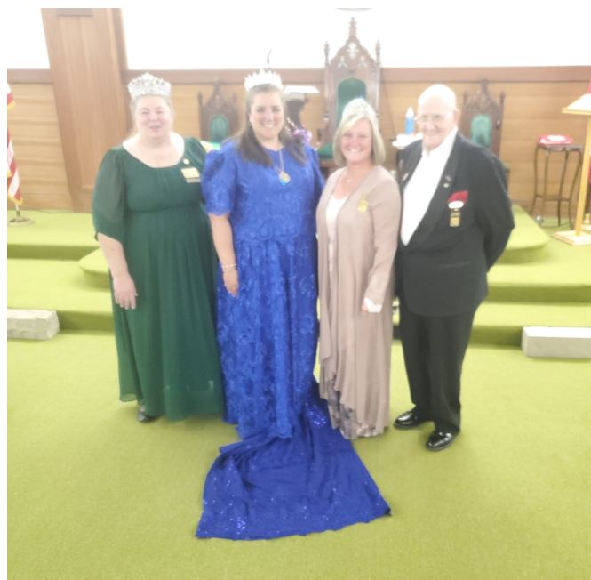
Heralds and Guardians in Pineland