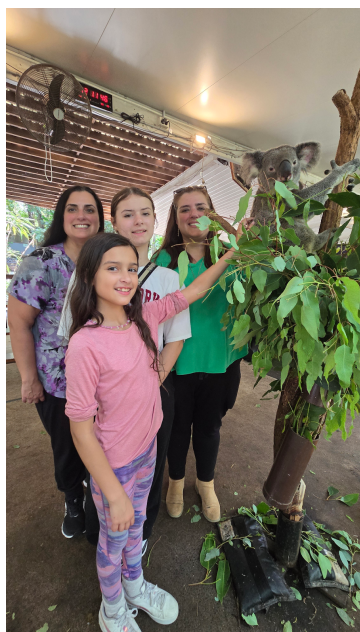
Petting a Koala in Queensland