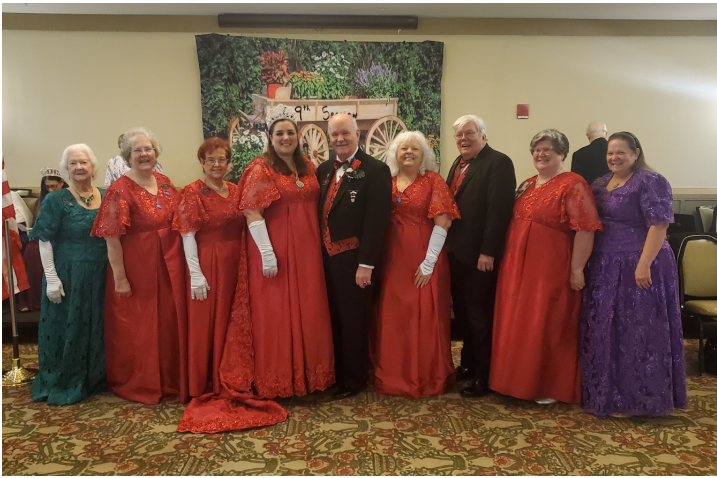
Supreme Officers in AL