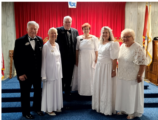
SAM, SAP, PSRMs, PSRP