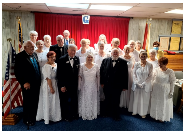
Grand Court Officers at organization of new court.