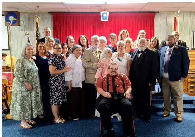
Magnolia Court UD new members. 19 initiated and several affiliated.