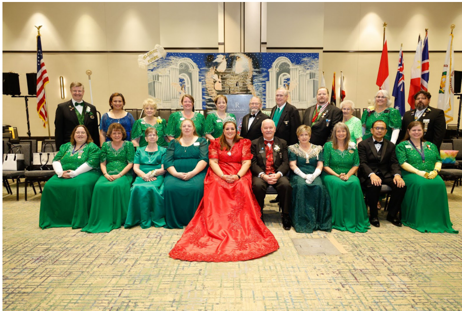
Heralds and Guardians at Supreme