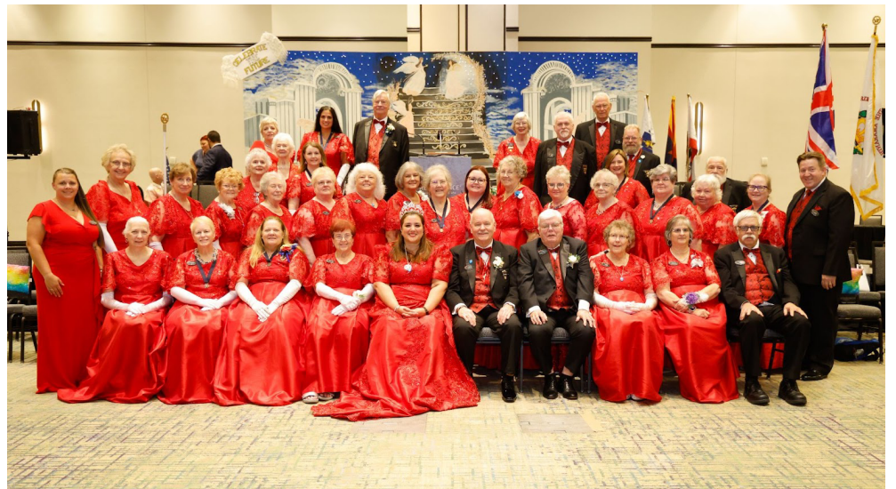
Supreme Officers - The Illuminators