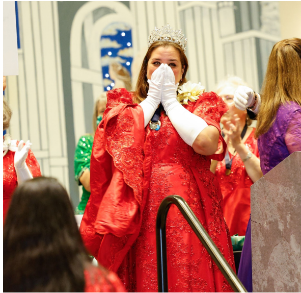
What an amazing year!